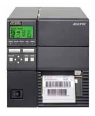
PRISYM Design Software is compatible with over 500 printer families